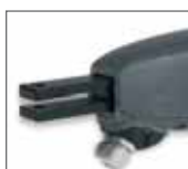
safe and protected connections

24 V irreversible electromechanical piston. For leafs up to 5 m.