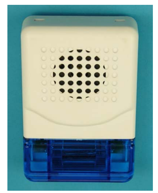
NB570 conventional (non-addressable) audio/visual alarm device